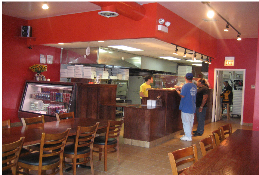
Ian's pizza offers a wide variety of original and delicious pizza pies.

This little pizzeria, located at 3462 North Clark, makes dining fun and enjoyable. The workers were friendly and helpful in identifying each pizza. If one wishes to have a premium, delectable meal in Wrigleyville, Ian's Pizza is the place to be.