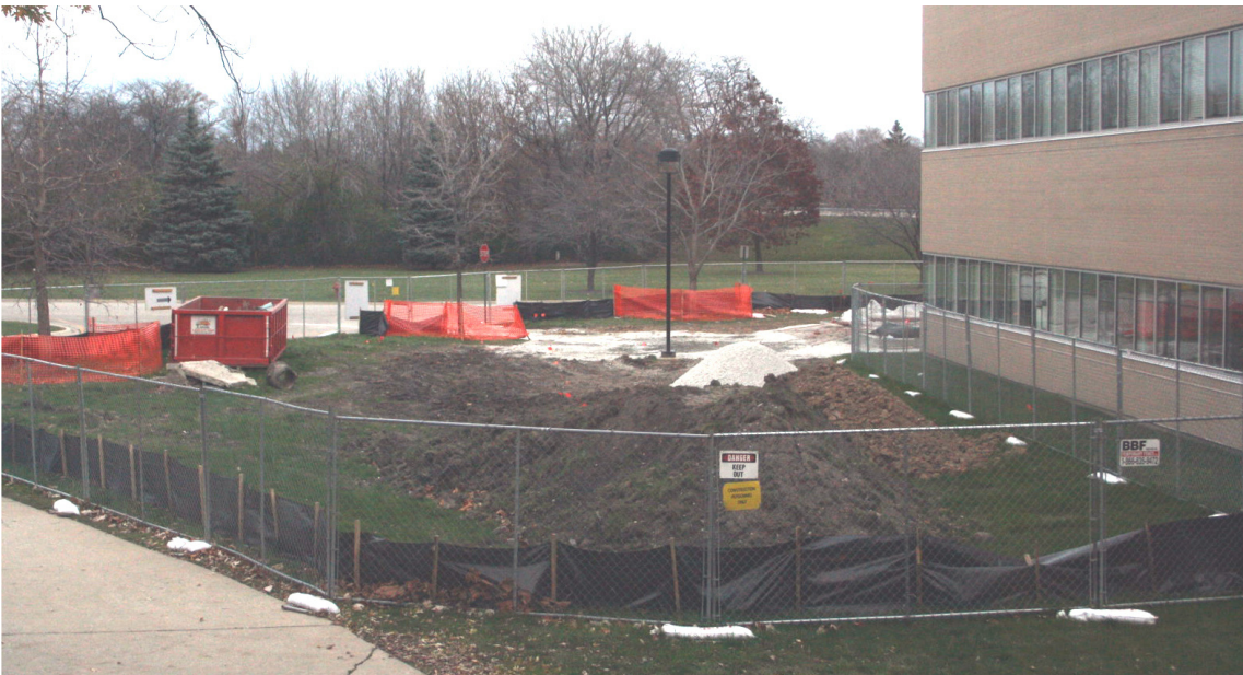
The construction site will serve as a six-room extension to the 1200 wing.

Plans call for the daycare center to be used only for District 219 staff members, but community parents might be able to use the daycare center if there are still available spaces after the staff has secured spots. Asked about why the daycare center is being built at West rather than at North, McTague said that West has more space to build while North has limited space due to its proximity