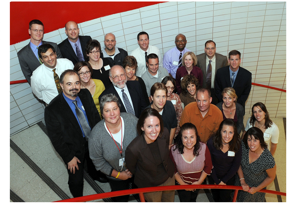
District 219 National Board certificate holders and applicants gather in the Contest Gym stairwell.

According to NBPTS, the portfolio that is submitted for evaluation consists of four entries: the first entry is a classroom-based entry with accompanying student work; second and third entries require video recordings of interactions between teachers and their students and the fourth entry documents teacher accomplishments outside the classroom and