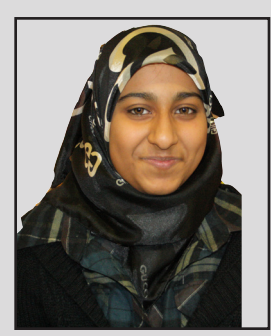
[The U.S.] has no right to invade other countries.